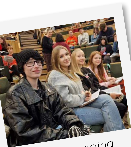
Students attending the A Level language conference in London

Our Year 12 and 13 A Level English Language students attended the English and Media Centre A Level Language conference in London. The conference featured five talks on a range of language issues given by real-life linguists and academics from universities all over the UK and journalists, talking about their research and the real-life impact of their work. The talks were linked to the students' A Level studies and offered insights into where studying language and linguistics at university could take them.