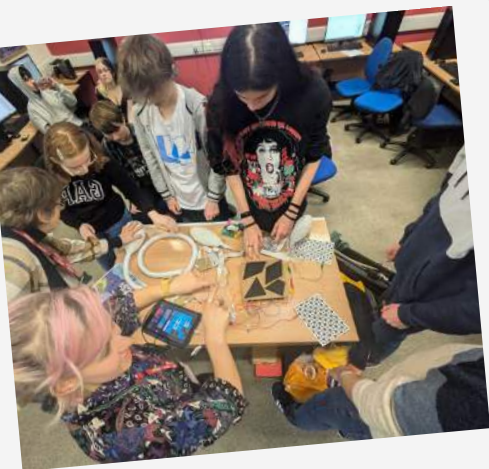
Media students in a workshop with a local artist

Over the past two weeks, the Level 3 Extended Diploma Media students have been working with artists from the local area to immerse themselves in different technologies to create a piece of work which looks at youth culture. The local artists who work alongside local arts group Collusion have run workshops in video mixing creatively, 360 cameras, and AR scanning to create a 3D image and use of immersive sound.