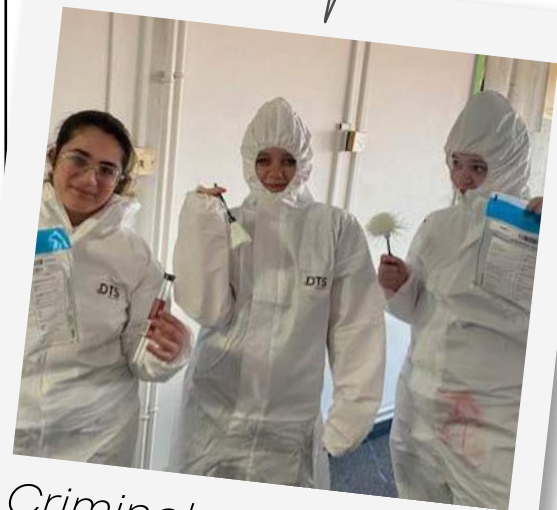
Criminology students with their evidence

Criminology students looked at Bloodstain Pattern Analysis in a recent session. They were taught about different patterns and how to determine what happened at a crime scene by examining the evidence left over. Students recreated these patterns using fake blood kits and acted as crime scene investigators to analyse other creations and determine the bloodstain pattern. They were also inspired to decorate their criminology folders using the materials.