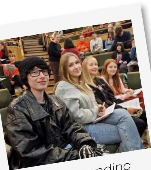
Students attending the A Level language conference in London

Our Year 12 and 13 A Level English Language students attended the English and Media Centre A Level Language conference in London. The conference featured five talks on a range of language issues given by real-life linguists and academics from universities all over the UK and journalists, talking about their research and the real-life impact of their work. The talks were linked to the students' A Level studies and offered insights into where studying language and linguistics at university could take them.